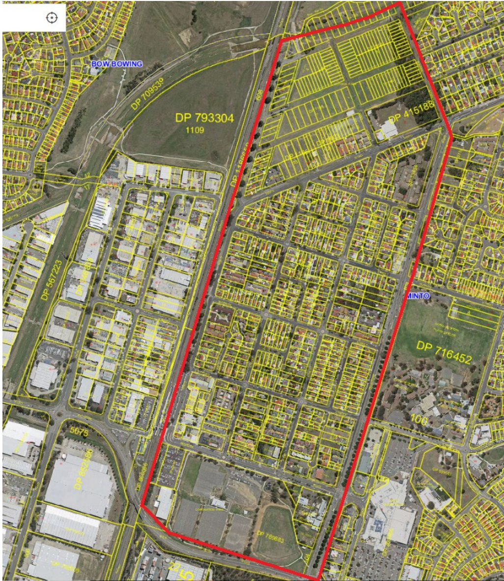
Figure 1 – Aerial photo of the site